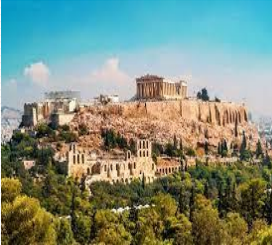
Acropolis and Parthenon