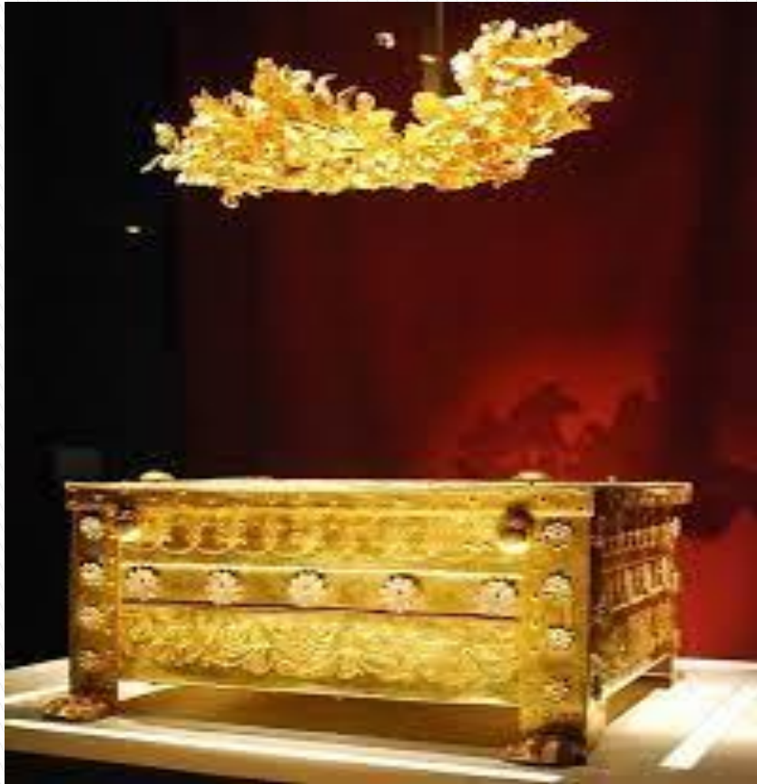
Vergina Museum in Imathia