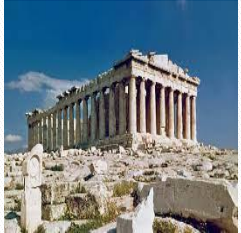
The temple is dedicated to the goddess Athena