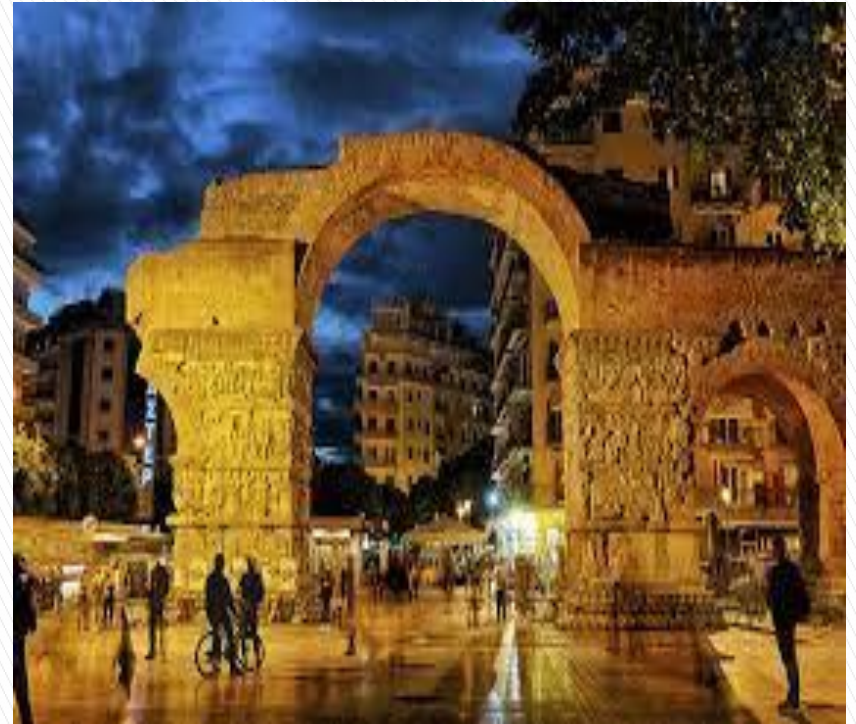
“Kamara” in the centre of Thessaloniki