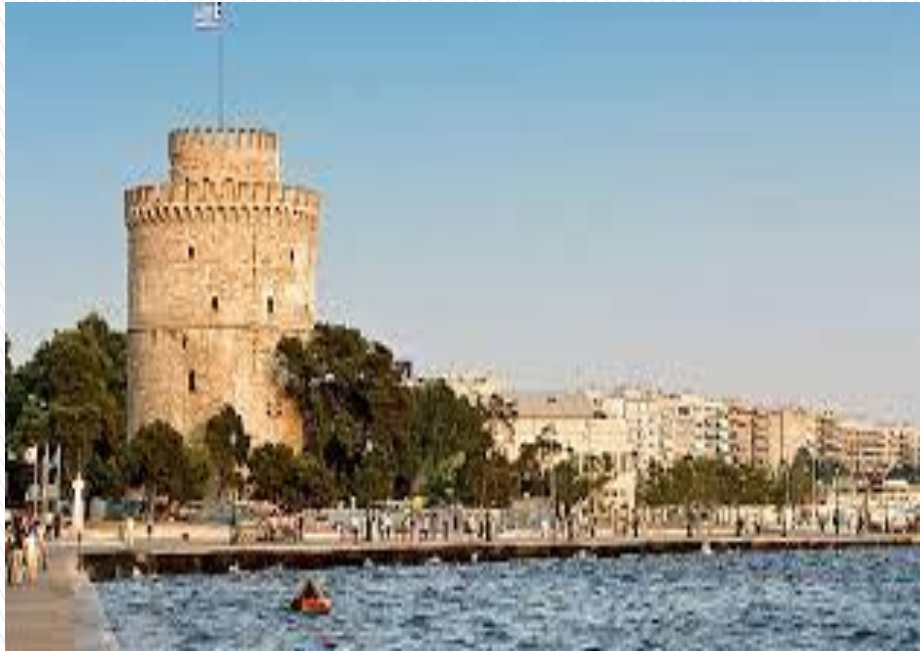
“Lefkos Pyrgos” White tower

Thessaloniki is the largest city in the North Greece, the second largest in Greece, the capital of Macedonia